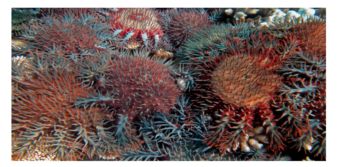
Image 1: COTS outbreak completely covering the surface of a reef in the GBR

COTS, or Acanthaster planci , are a naturally occurring species of starfish that feed on live coral tissue. They are native to the Indo-Pacific oceans and play a role in their ecosystem; therefore, it is not ethical to completely remove them from the ocean, as they do serve a purpose in the marine circle of life. Mature COTS have up to 21 arms and hundreds of 4 cm-long toxin-tipped thorns.<sup>2</sup> Consequently, adult COTS are prey for just a few marine species, although still a source of food for the giant triton snail, the humphead Maori wrasse, starry pufferfish, and titan triggerfish.<sup>3</sup> Juveniles and larvae are more largely preyed upon by different types of shrimp, crabs, and polychaete worms.<sup>4</sup> Additionally, because they tend to feed on faster-growing species of corals, they can create space on the reef for slower-growing corals which provide different habitats, sequentially increasing the biodiversity of the reef.